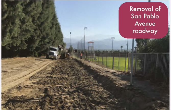
Removal of San Pablo Avenue roadway