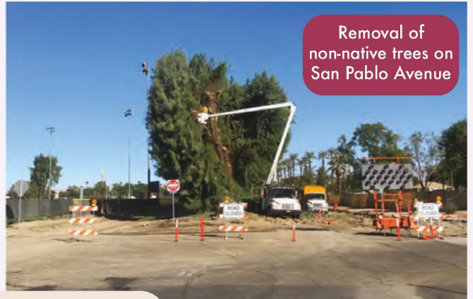
Removal of non-native trees on San Pablo Avenue